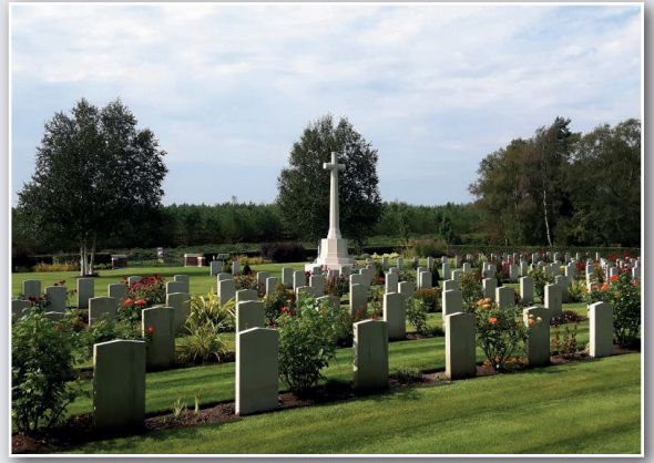
Cannock Chase War Cemetery