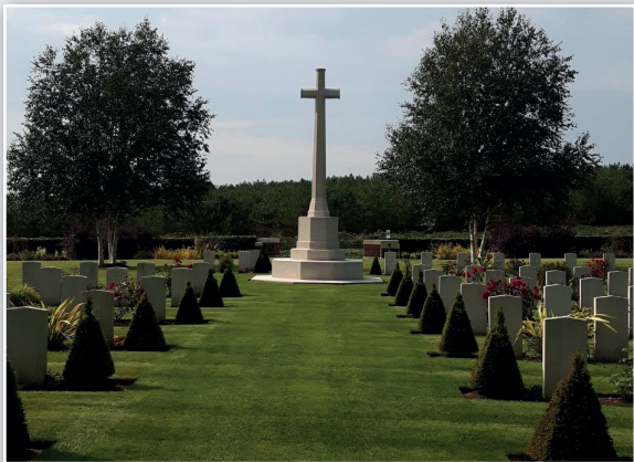
Cannock Chase War Cemetery